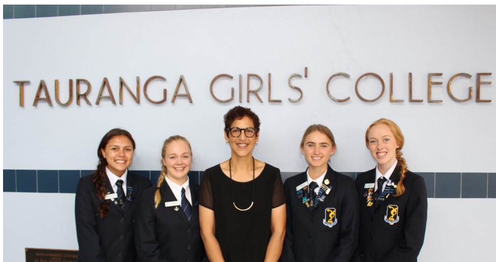
Principal with Head Students