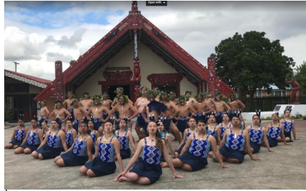
Qualifying Team - October 2017

Practice and noho wananga have started in preparation for the competition and are held every weekend until July. All members